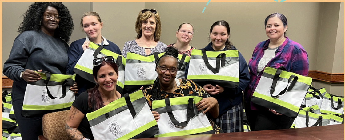
2023 Conference Volunteers! Our bag stuffers...