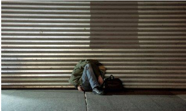
Youth Become Homeless