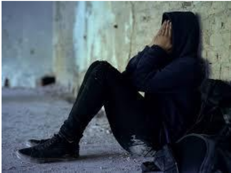
Mental Health Issues