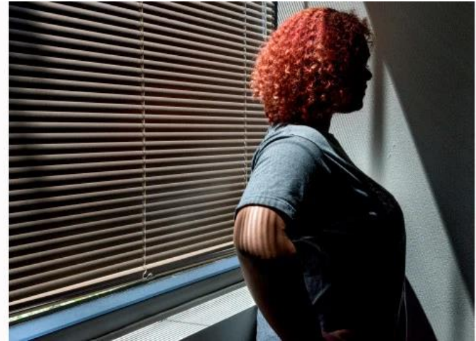
Early Teenage Pregnancy